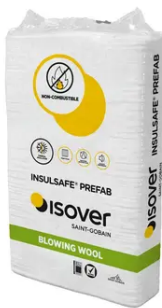
Figure: Representation of product